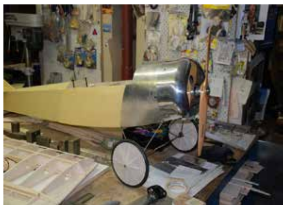
Check out those wheels

Education has never been the exclusive domain of the young. Old blokes like me are more than happy to learn about anything aviation related. Model building techniques are high on the list of things I want to learn. Although I always stick to what I know does work, much can be learned from other modellers if you spend time observing and applying practical knowledge. I tend to be a functional builder and do aim for perfection without counting too many rivets.