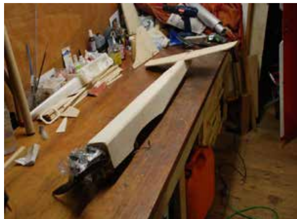
Fuselage in basic form

I have been in constant touch with the Moorabbin branch of the Australian Air League with a view to working with them on a more consistent basis. Last year we took the group out to The Yarra Valley Aeromodellers club field at Yarra Glen to give them some flights on buddy box. This was very successful and we will do it again, but in the mean time their commanding officer is keen to get the cadets started on model building. We will begin with basic design chuck gliders and work our way up to full radio control. There are two trainer kits