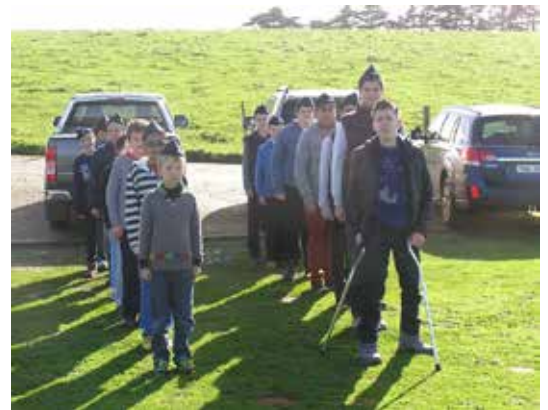
Cadets lined up for a pre-flight briefing

There were however two boys and one girl who were switched on enough to impress me, as is often the case, so I engaged them as much as possible. I did not have much time to do my normal bit as only twenty minutes was allocated for my talk. There were other activities planned for the night as well (which did include paper darts) and that was ok, as it gave me time to assemble some Spitfire chuck gliders ready for later. I always go armed with an electric plane these days as it allows the kids to have a go on the sticks and observe and learn what each control surface does. I then give them all a blow wave with the prop at full bore and this is always good fun.