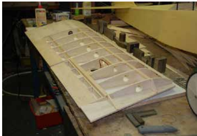
Traditional built up wing..

now available in build up form so we may use them and possibly plan build something else as well.