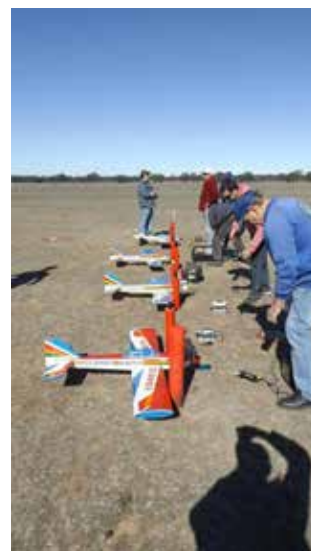
Gentleman... Start your engines

During the lunch break, 3 of the pilots brought their Large Scale Race aircraft the Seagull Models, Nemesis 80 inch size. This was for a test flight, practice and demo race. They all seemed to go the same speed even though they all had different brand engines (OS 33cc, NGH 35cc and DLE 35cc). It was also noted they had different size and types of propellers. This should make an interesting class to be involved in and comes under the heading of "F2" or "Nemesis 35" class.