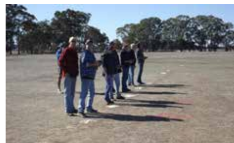
Pilot's box in full swing

10 am came around and it was time for the welcome and race briefing. We should also to mention the fact Model Engines are the supporters of this Scanner Challenge that we have conducted here in Bendigo over the last 3 years.