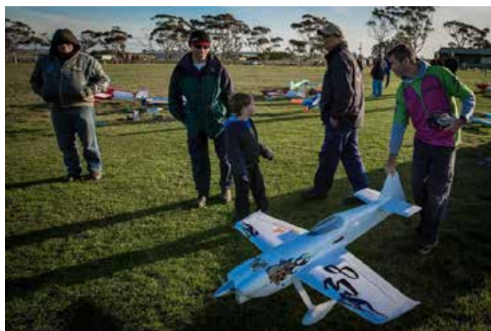
Brian Simpson with Seagull MSX-R in Red Bull