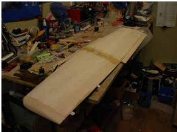
Balsa sheeted foam wing ready to move onto the next phase.

Later in the evening I organised a chuck glider competition using their pack formation as a basis. I showed them what to do, having allocated two gliders to each pack and was ready with backups in case of breakage. I threw the first Spitfire chunky which was left on the floor as a benchmark, being that it had a steady glide. The Cubs had a ball and many had good flights, but none of them surpassed mine of course. One was very close though.