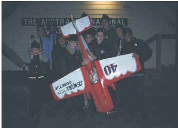
Air League Morrabbin Squadron meeting at Moorabin

Formula 2 is the entry into large models. 80 inch span and 35cc petrol this cool looking model is groovy to fly and a cinch to land. This model is pretty well viceless. Early heats have proven the concept is right on the money. Different engine prop combos are within a few kph of each other. To give everyone a fair go, the winner of the Championship is not allowed to compete the following year, but, the model can easily be re-fitted with a 55 cc engine to compete in F1. One of the things I did when I reviewed this aircraft a couple of years back, with the 55 cc engine, was a full throttle power dive from a thousand feet, roll it on its side and