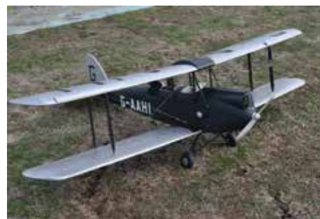
Rob Popelier's DH60. Still sorting a couple of things but still flew well.

The flying only category was spread over a larger margin with Noel Whitehead and his RV4 being a clear winner at the end of the day.