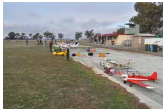
A cold but calm Saturday greeted us at VRF. Great turnout.

This event is held each year at the Valley Radio Flyers field in Shepparton during the long weekend in June. The refurbished runways are in excellent condition and provided an easy transition from one runway to the other, depending on wind direction and sun location. For example, each morning the event would start on the East/West runway, so the sun was not in your eyes early in the morning and by 10:30 am, moved to the main runway with very little fuss. This kept things moving with little down time.