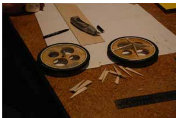
Wheels make the world go round