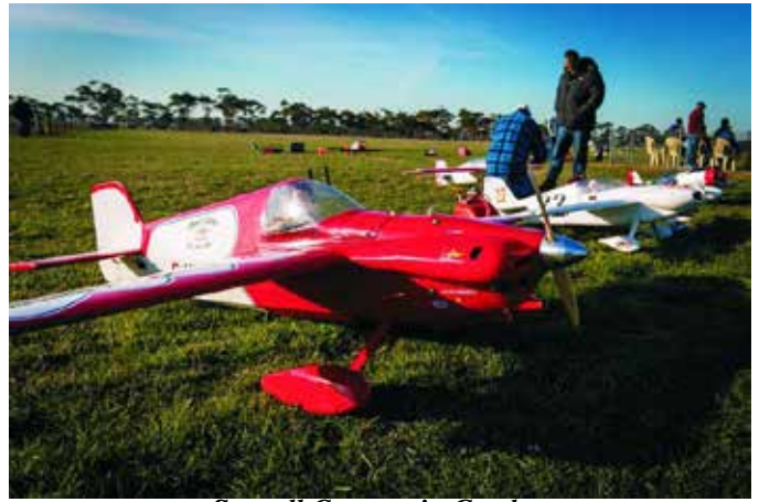
Seagull Cassutt in Goodyear

Goodyear is for the more experienced campaigner. Not just in racing, but for anyone who has competed in other forms of model flying. It's a great model. A little quirky on rudder but totally manageable. Mine knife edges with a "pooftenth" of rudder input. These were the models that raced at Sandown and subsequent heats have proved another pretty even match of speeds with different engine prop combos.