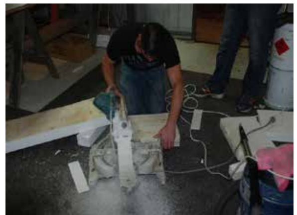
Why cut foam by hand when you can use a drop saw!!!!

Never walk through the pit area with a armed electric model Please remember - "Spinning Propellers" are Dangerous