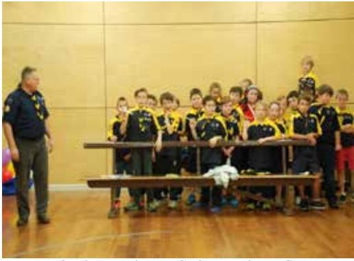
2nd Hawthorn Cubs ready to fly

As it is only a short time since our last newsletter and my last report I will have to make this a fairly short one. There is however, always something happening on the education scene and that helps keep me out of mischief. I recently was invited to do my usual introductory presentation to the 2nd Cub/Scouts group in Hawthorn. There were about 25 young people in uniform, some parents and of course their leaders. I always start with a basic insight into why things fly, and this gives me an opportunity to relate to the kids better and get them asking those all important questions. There was one young fellow who excelled at telling me about many things, some of them relevant and some of them not so, but it was very entertaining listening to him. I assumed the he attended Scotch College but this was not the case.