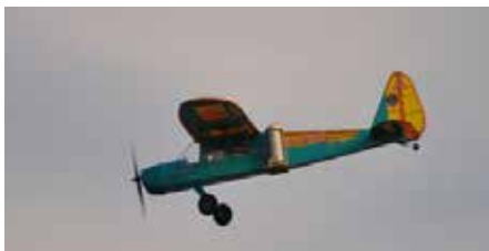
Some interesting designs Clubs come up with in dropping their bomb..... Simple but clever.