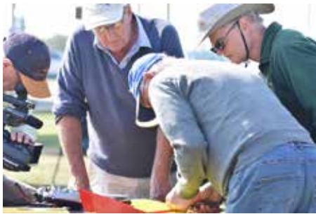
The VARMS Team in action. What's this..... There own camera crew!!!!

and by 10:00 am we were back in the air with the first event of the day, the Fun Fly.