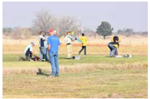
Thermal glider in action. Another popular event