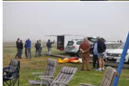
The fog did not stop the Heli event from going ahead. (Top) CD Paul Webber running the show