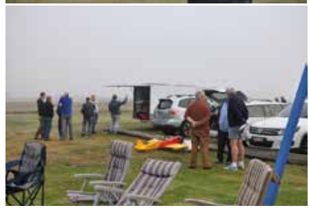
The fog did not stop the Heli event from going ahead. (Top) CD Paul Webber running the show