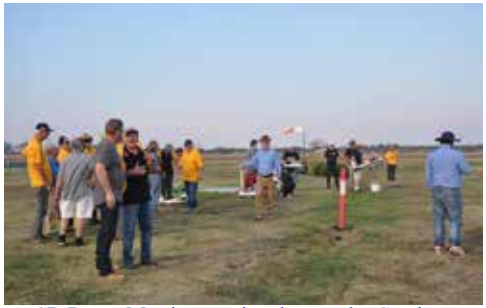
CD Reeve Marsh preparing the popular Combat Event. Lots of fun chasing each other around the sky.. Below, pilots raising for position..