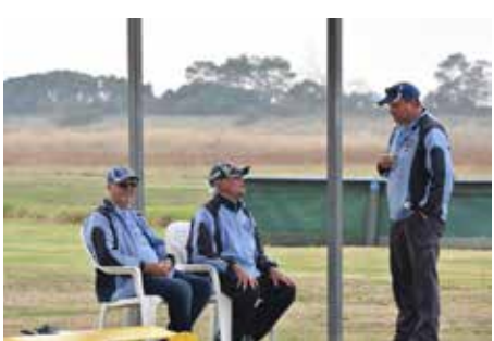
LaTrobe having a break to discuss tactics

I must also thank the VMAA Committee Members assisting with events and official tasks throughout the weekend. Many things happen in the back ground to ensure the event is conducted in the best possible way with the rule and conditions laid out.